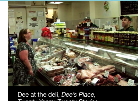
Twenty Years: Twenty Stories

discussing the different types of places where people can feel included or excluded, and evaluating how this affects perceptions about the liveability of places