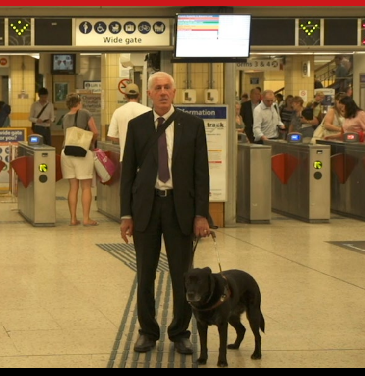
Graeme Innes, Graeme Innes vs Railcorp , Twenty Years: Twenty Stories Film Project, Australian Human Rights Commission