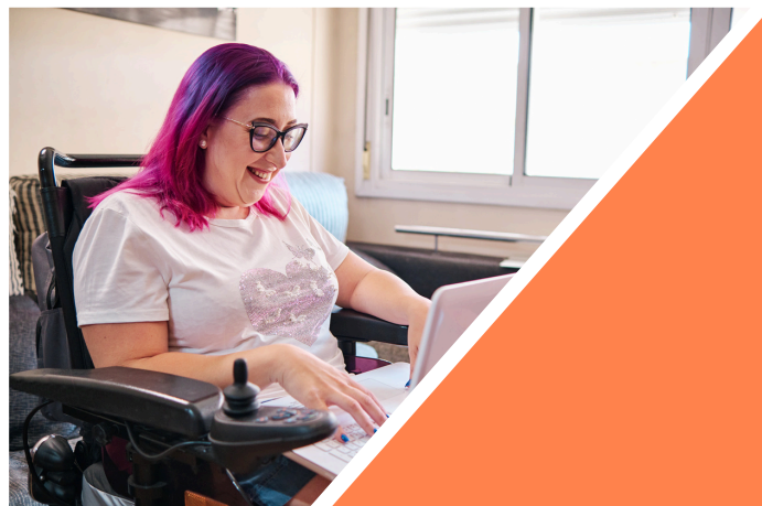
A participant with bright pink hair making an awesome new song

Our mission is to help you find your strengths so you can flourish. Whether it's discovering new skills or improving your well-being, we're here to support you. With a special focus on music, we help you find your groove.