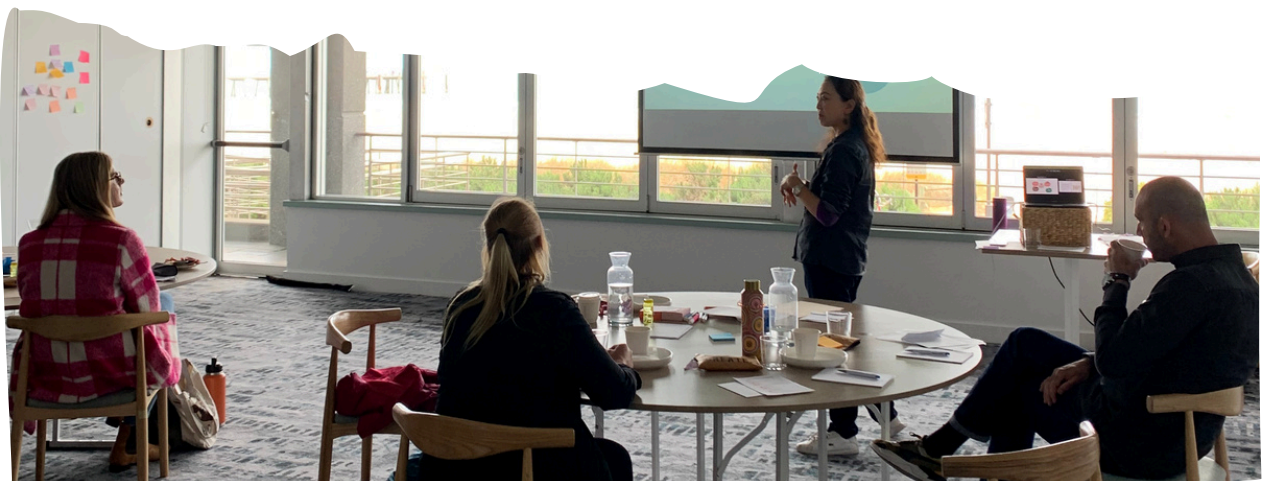
CTA Team at our annual training and planning day 2023

To create this DIAP, we also asked for feedback via our social media channels, newsletter, and provided a physical copy in our clinic waiting room for you to review. We are always open to your feedback and ask you to provide any ideas for ways this DIAP can be improved at any time. You can call us, email info@creativetherapyadelaide.com.au , or tell us in person. We are happy to take your feedback in whatever communication style you are comfortable with and are here to listen.