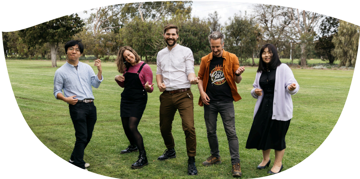
Some of our music therapy team playing air guitar