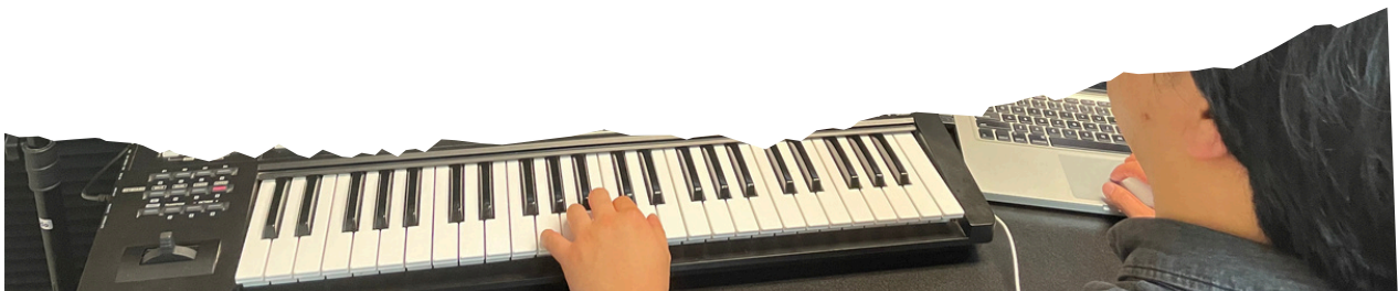
Playing a keyboard at our CTA recording studio

At Creative Therapy Adelaide, we acknowledge that accommodating people with disabilities is both a moral imperative and a legal requirement. The Disability Discrimination Act 1992 (DDA) is a key piece of legislation in Australia. It aims to protect individuals with disabilities from discrimination and promote equal opportunities. The DDA prohibits discrimination based on disability in various areas of public life, including employment, education, access to goods and services, accommodation, and participation in public activities. It ensures that individuals with disabilities have equal rights and opportunities. It also places a responsibility on businesses, organisations, and service providers to make reasonable adjustments to accommodate the needs of people with disabilities. The DDA plays a vital role in promoting inclusivity, accessibility, and equal treatment for all Australians, regardless of their disabilities. It contributes to creating a more equitable and inclusive society.