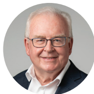
Robert Fitzgerald AM Age Discrimination Commissioner Australian Human Rights Commission

Ageing is a natural stage in our lives that should be celebrated, and the complexities acknowledged. It is vital that older people are humanised and valued in mainstream culture, with their voices amplified, and the issues they face told in an accurate and balanced way. Simply put, older people have the right to have voice and presence in Australia's media and the stories they tell.