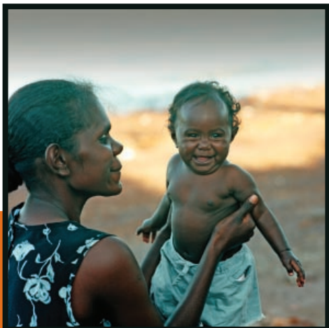
'Angelina and Baby' Bathurst Island, 2004.

Governments have made commitments to try and address Indigenous health inequality but always without a specified time frame.