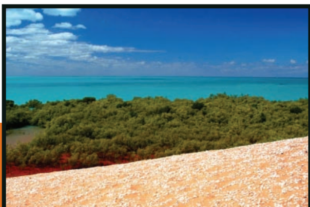
This ocean image is taken near Broome, Western Australia. In the foreground is a midden (a sandbank covered with shells discarded by the local people after the contents were eaten). Below the midden are the mangroves where all types of seafood is hunted and collected and finally, the beautiful warm waters.