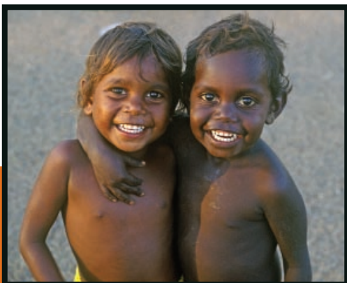
Bathurst Island, 2004.

The main emphasis in rolling out the human rights based approach is for governments to build on already existing structures