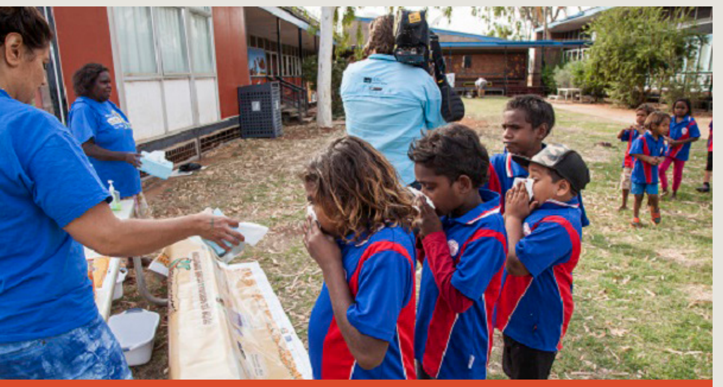
Community Based Workers leading the way in education and practice for trachoma elimination.

Again, it is encouraging to see some indications that the PHNs are looking to incorporate culturally safe practices as evidenced by the Guiding Principles document between PHNs and ACCHOs. The Guiding Principles state: