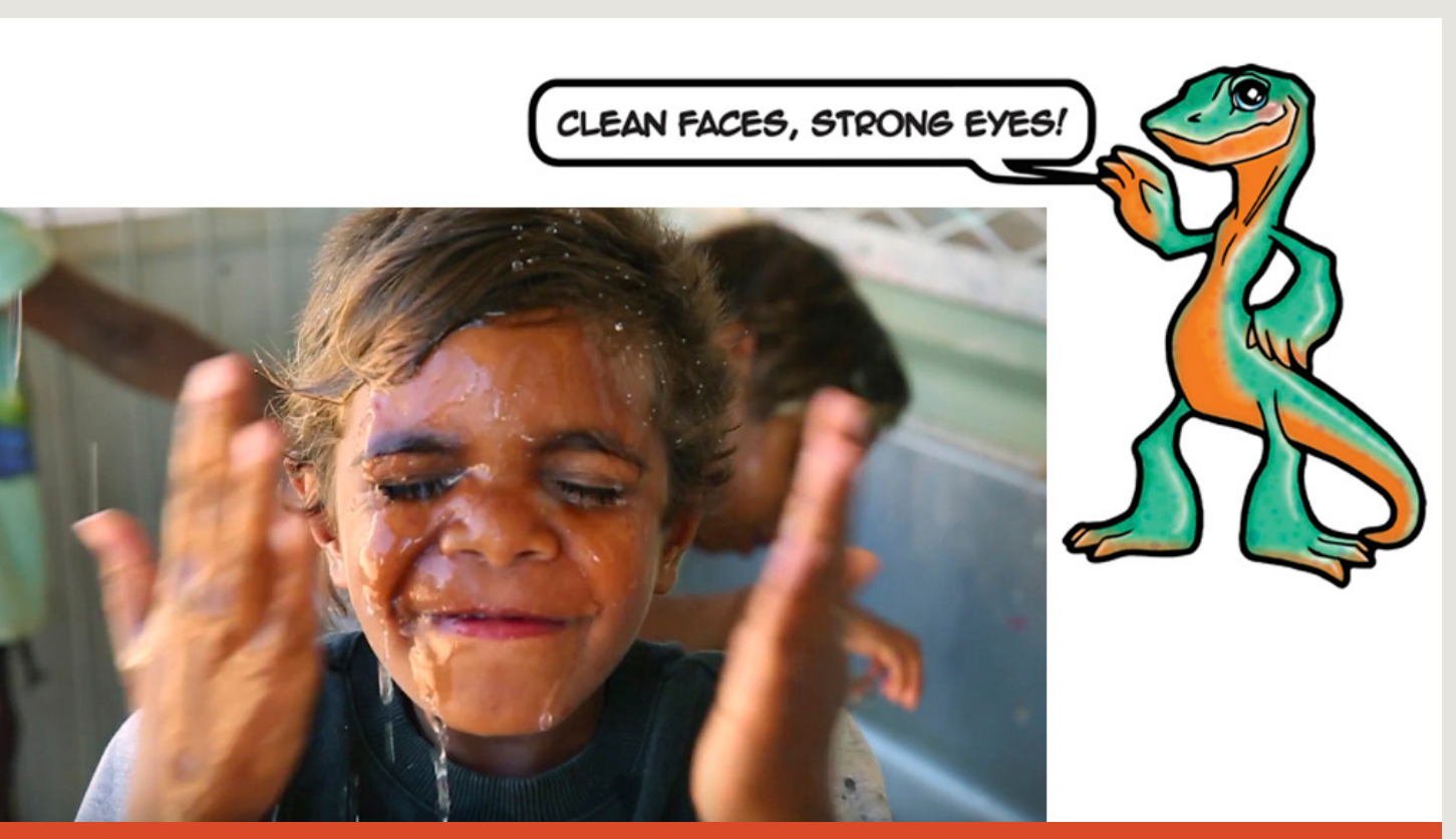
Milpa the Trachoma Goanna program 'clean faces, strong eyes'. Oak Valley.

With support from The Fred Hollows Foundation, Community Based Workers (CBWs) and other members of the local workforce have contributed to the SAFE strategy to help eliminate trachoma.